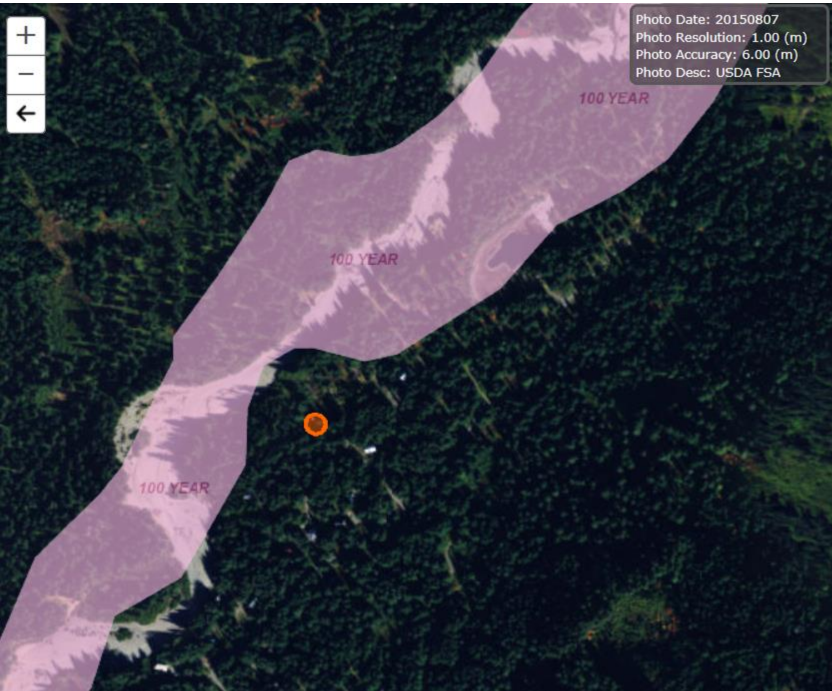
Photo Date: 20150807 Photo Resolution: 1.00 (m) Photo Accuracy: 6.00 (m) Photo Desc: USDA FSA